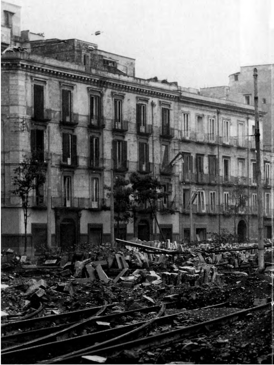
Wreckage in the dockyards at Naples.