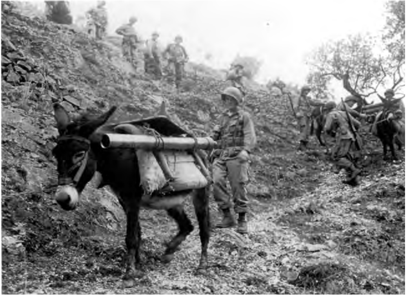
Pack train moves supplies in the mountains.

Infantry Division, for example, had seen its effective strength reduced to sixty men; the 2d Battalion of the 143d Infantry, which had been in the Sele River corridor, had almost ceased to exist as a unit. Meanwhile, the British Eighth Army continued its advance as the Germans disengaged at Salerno and withdrew north. By 19 September, elements of Montgomery's and Clark's armies met at Auletta, twenty miles east of Eboli.