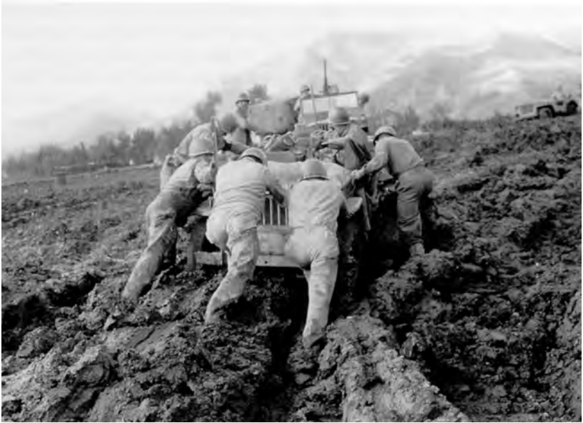
Waging war against mud.

miles north of the British 10 Corps on the evening of 14 September to disrupt German resupply and communications lines. The paratroopers had been ordered to harass the Germans for about five days and then either to infiltrate to the beachhead or to link up with advancing forces. Of the 40 planes involved in the operation, only 15 dropped their cargo within 4 miles of the drop zone; 23 planes scattered paratroopers between 8 and 25 miles from the intended target, and the drop site of the remaining 2 planes was unknown. Of the 600 men who jumped, 400 made it safely back to Allied hands several days later after launching small raids in the German rear.