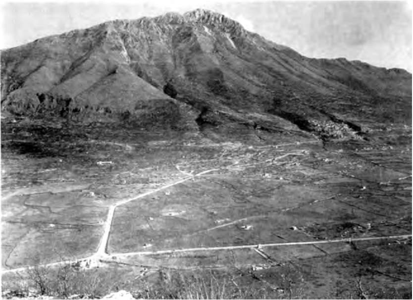
Monte Sammucro with San Pietro on the right.

west, Germans opposing the British 10 Corps held out until 8 January, then withdrew to prevent being trapped. Fifth Army continued to press the attack, and a final assault on 14 January met only limited resistance. The Germans had withdrawn behind the Rapido River the previous night. The Fifth Army had broken the Bernhard Line, but the formidable Gustav Line defenses and Rome lay ahead.