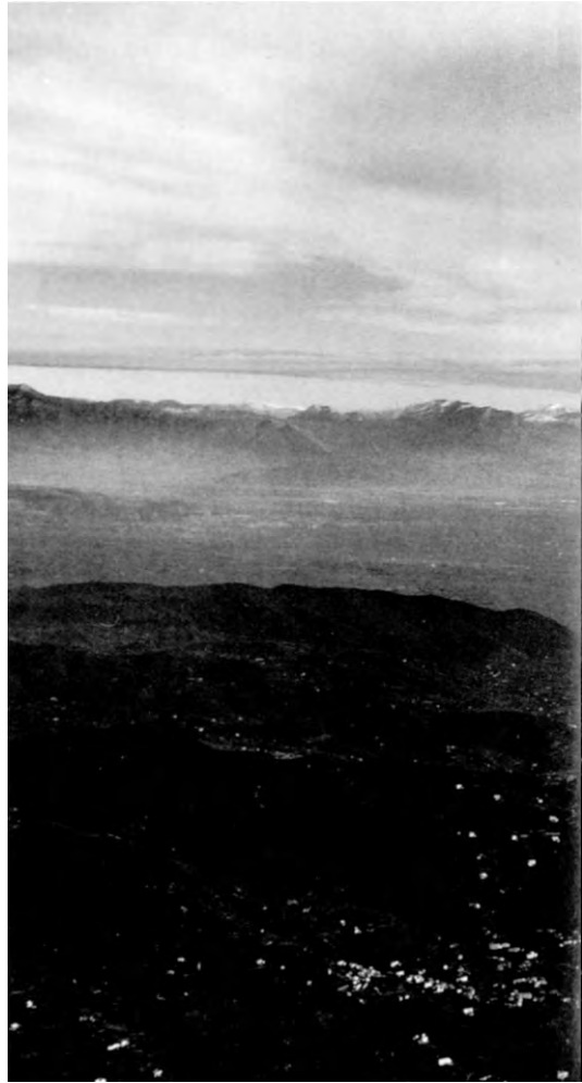
The Gulf of Salerno.

Clark expected to meet some 39,000 enemy troops on D-day and about 100,000 three days later after German reinforcements rushed to Salerno. He hoped to land 125,000 Allied troops. The British 10 Corps on the left was to land its two divisions abreast south of Salerno. The U.S. Rangers and the British Commandos were to land at beaches west of Salerno and secure the left flank by seizing key passes through the mountainous Sorrento peninsula between Naples and Salerno. Control of the passes would permit a rapid exit from the Salerno plain and protect the beachhead from German counterattacks