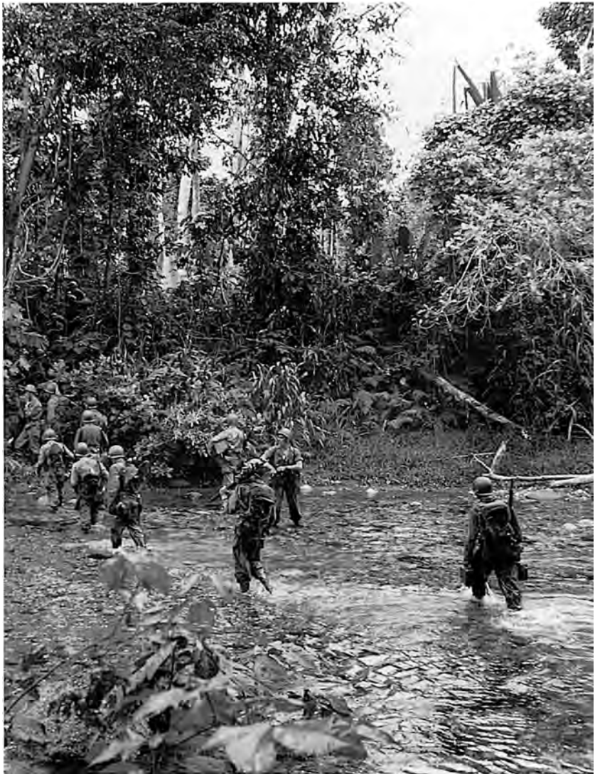
Troops of the 32d Division near Saidor.

firepower forced the numerically inferior Japanese to retreat. By midafternoon the Americans controlled the peninsula.