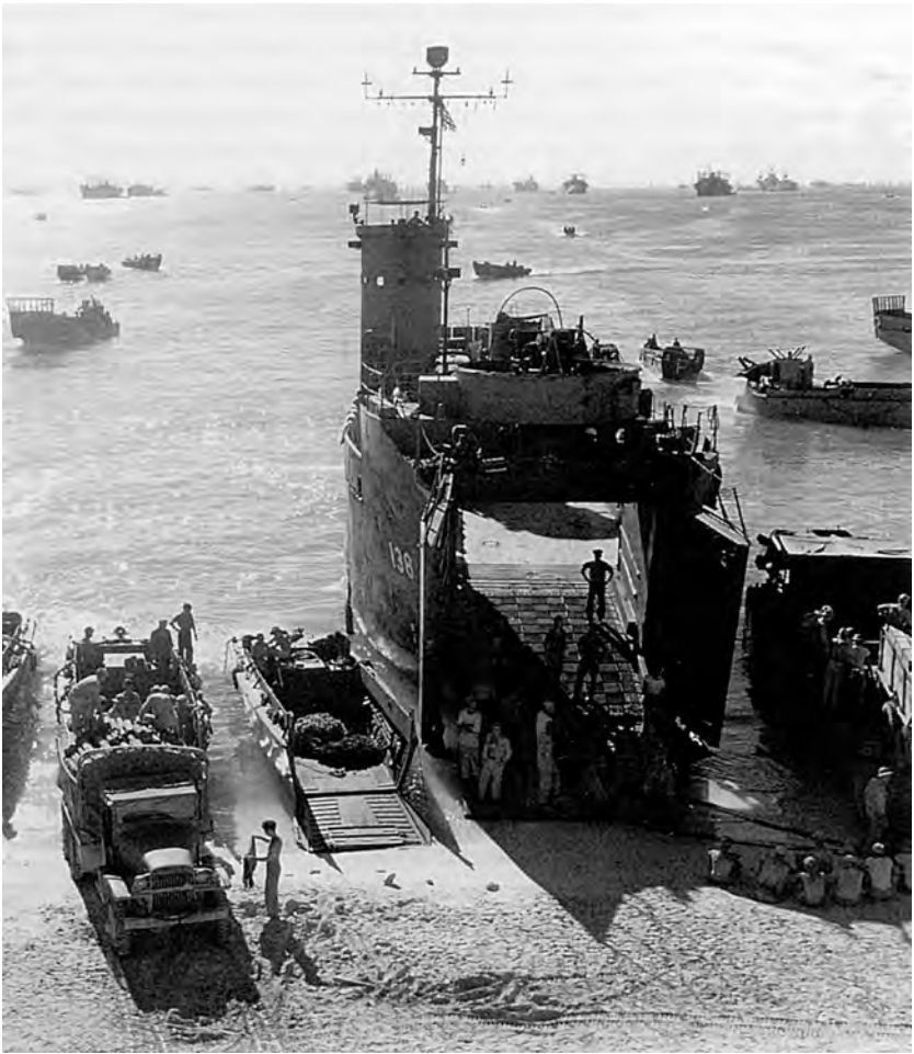
Supplies and equipment are loaded aboard amphibious craft at Seadler Harbour.

The arrival of the reinforcements convinced Colonel Ezaki that the American main effort was in fact at Hyane Harbour. He planned an attack on the Los Negros perimeter for the night of 2 March but delayed it for twenty-four hours when American artillery and naval gunfire prevented him from massing his forces. The fighting which finally occurred on the night of 3 March proved to be the most critical during the battle for the Admiralties.