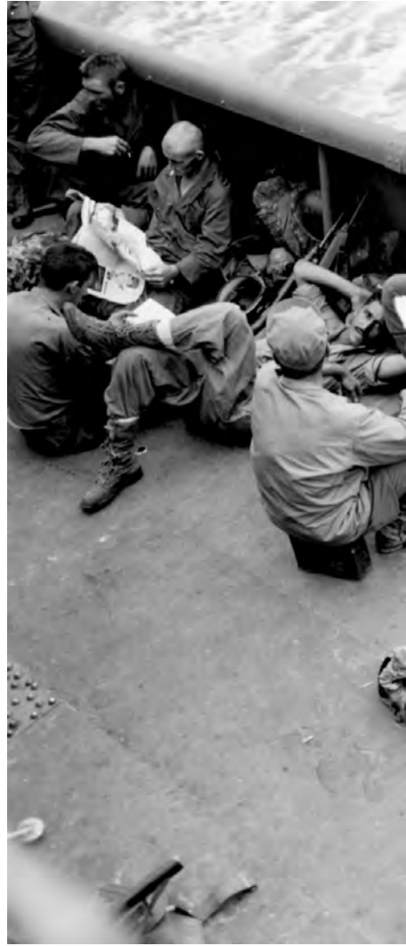
1st Cavalry Division troops en route to the Admiralties.

North-East New Guinea, had given them a base beyond the other side of the straits and thus secured unhampered access to the Bismarck Sea. Yet western New Britain's utility as a forward operating and support base proved less critical to the Allied campaign than originally anticipated. The commander of the American PT boat squadron in the area declined to establish a base at Arawe, and Allied pilots preferred to use the airfields at Cape Gloucester. On 24 April the 40th Infantry