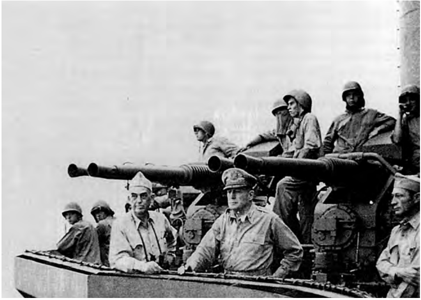
Admiral Kinkaid and General MacArthur aboard the USS Phoenix.

The division had spent the first years of the war guarding the Mexican border and arrived in the Pacific in the latter half of 1943. Although the Admiralties operation would be its first combat action, its soldiers had received extensive training to prepare them for their mission.