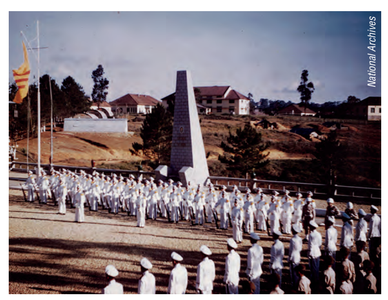
Cadets at the Da Lat Military Academy

training school at Nha Trang where some of the early training teams from the U.S. Army Special Forces conducted their first missions in Vietnam. Special Forces provided a critical component of training to the South Vietnamese armed forces.