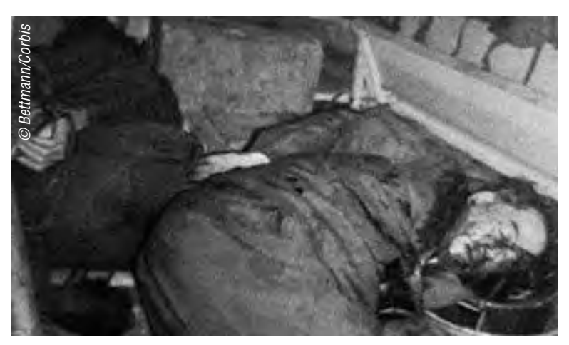
The bodies of Diem (right) and Nhu lie in an armored personnel carrier shortly after they were killed on 2 November 1963.

ment and personnel followed over the next year. This led to near paralysis in government programs in the countryside and to continuing ineffectiveness of the military. Diem, for all his faults, was an unquestioned patriot who had succeeded in maintaining control and creating a functioning—if inefficient—regime. His removal created a crippling vacuum that no one seemed able to fill.