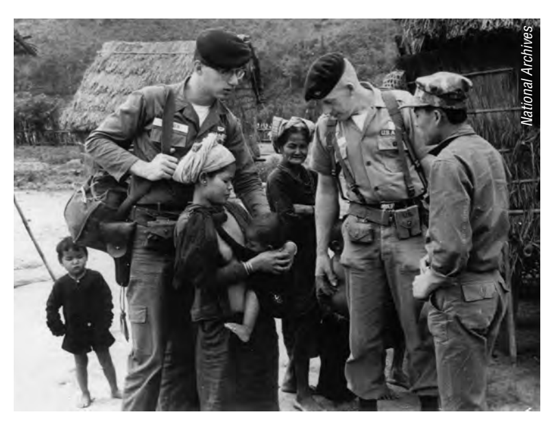
Special Forces medics check a Montagnard baby as part of the Civilian Irregular Defense Group program in 1963.

same model until 200 villages were included and 60,000 people were effectively being protected from Viet Cong attacks and thus were counted as being in support of the government. By September 1962, the program was so large and absorbed so many military resources that the Kennedy administration transferred it from CIA to Army control in what was called Operation SWITCHBACK. The Army activated a new headquarters in Saigon (later moved to Nha Trang), U.S. Army Special Forces (Provisional), and gave it control over the twenty-four Special Forces detachments in the country, many of which were engaged in what was now called the Civilian Irregular Defense Group (CIDG) project ( Map 4 ).