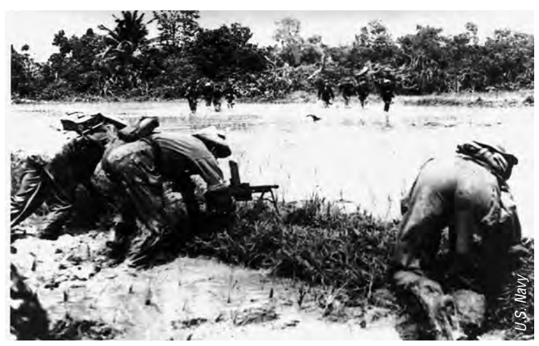
French machine gunners have just enough time to throw themselves on the ground and put their weapon in play as Viet Minh soldiers attack.

implement grand plans with its limited resources and decreasing support from its government and people.