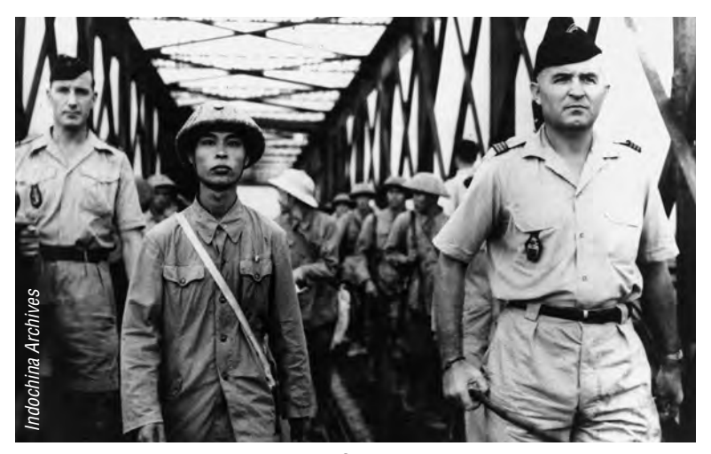
French soldiers escort Viet Minh into Hanoi, October 1954

Commission consisting of representatives of India, Poland, and Canada, and free elections were to be held in North and South Vietnam in July 1956. The United States did not concur in the final declaration but pledged to "refrain from the threat of the use of force to disturb" the agreements while warning that it would not stand idly by at any renewal of attacks in violation of the agreements. The outcome was nothing less than a major defeat for France, the United States, and the free world. The Geneva Agreements ceded half the country to Ho Chi Minh's Communist-controlled Democratic Republic of Vietnam, with its capital in Hanoi. This left South Vietnam under the weak remnant of a government headed by the last Vietnamese emperor Bao Dai and his new prime minister, Ngo Dinh Diem, with its capital in Saigon.