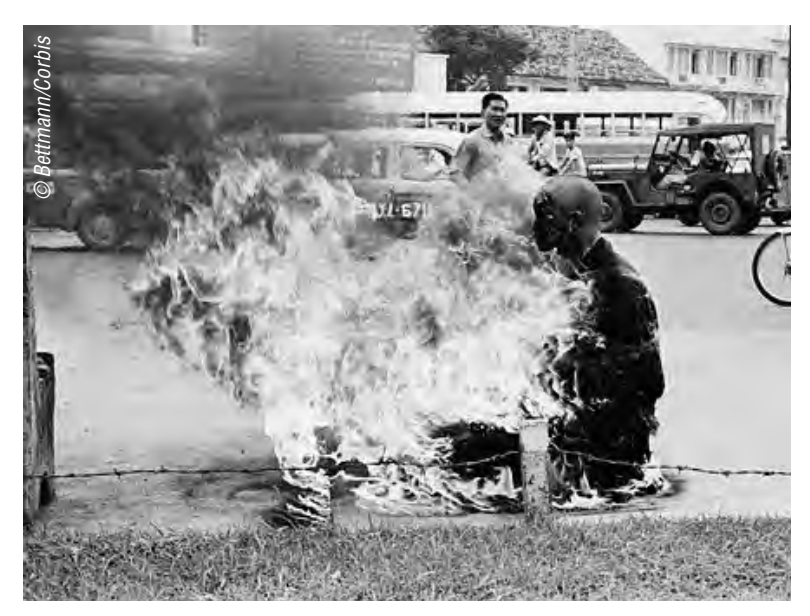
A young Buddhist monk performs a ritual suicide, by self-immolation, in the central market square of Saigon on 5 October 1963.

a series of raids against Buddhist pagodas. The United States began to lose faith in the ability of Diem to rule his own people, let alone conduct vigorous operations against the Viet Cong insurgents.