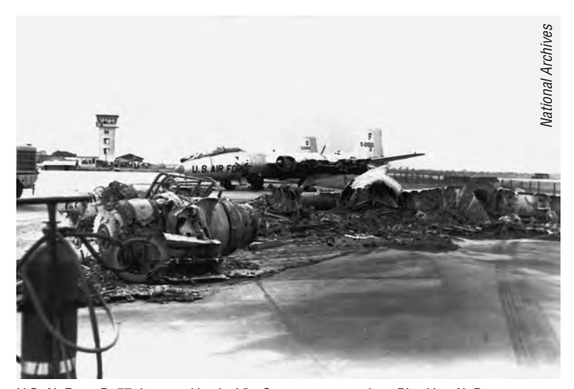
U.S. Air Force B–57 destroyed by the Viet Cong mortar attack on Bien Hoa Air Base