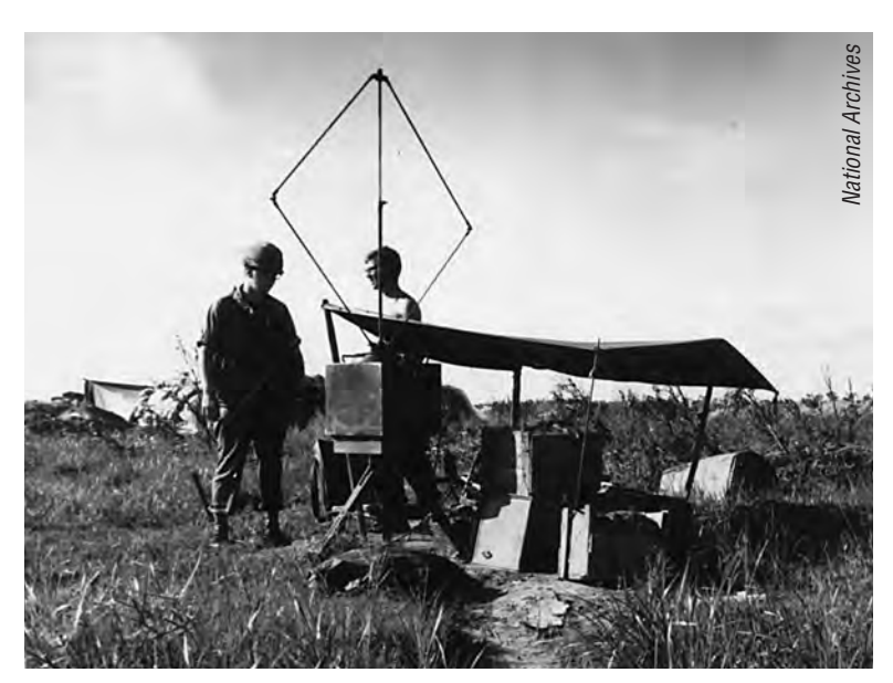
Radio direction finder in Vietnam

advisers at MAAG headquarters probably spent more of their time doing staff work than actually advising the Vietnamese. Even after the reorganization only about 30 percent of MAAG personnel actually served with troop formations; most advisers continued to work at schools, training centers, and with higher command, staff, and logistical elements, many of which were located in and around Saigon.