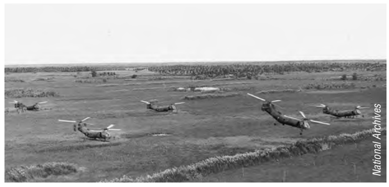
H-21 "Flying Banana" helicopters unload South Vietnamese soldiers in 1962.