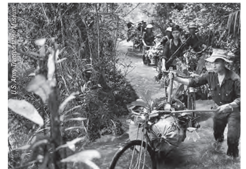
Bicycles are used to transport supplies down the Ho Chi Minh Trail.

By 1960, the successes the Viet Cong guerrillas had achieved were the result of a well-laid plan orchestrated by the North Vietnamese Communist party. To support the growing insurgency, the North had established a special logistical unit in early 1959 tasked with building a network of trails and roads through the jungles of Laos and Cambodia to the porous border of South Vietnam. This network, known as the Ho Chi Minh Trail, was the lifeline of the