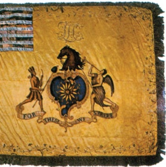
Flag of the Philadelphia Light Horse Troop, 1775

selected Army flags would display the streamers. President Dwight D. Eisenhower issued an Executive Order establishing the Army flag, which was unveiled on 14 June 1956 (the Army's birthday) in Philadelphia (the Army's birthplace). Because the flag had one streamer per campaign, the same system was adopted for units. 37