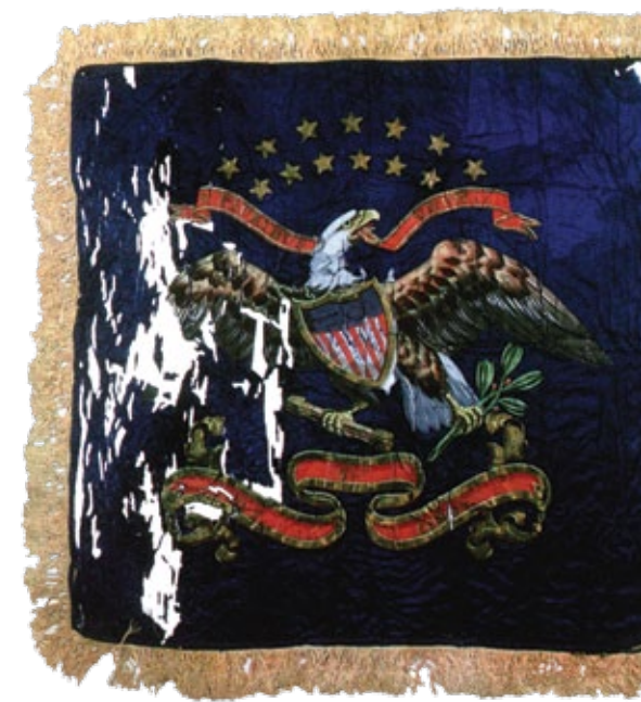
Cavalry Regimental flag, post-Civil War era

In 1891, Acting Secretary of War Lewis A. Grant renewed the idea of preparing a complete inventory of battles and skirmishes. This time the list was to be published in general orders rather than in the Army Register. (While the inventory was being prepared, the secretary instructed The Quartermaster General to issue colors and guidons without silver rings until the battle inventory was completed.) The list was submitted to the Secretary of War for publication in 1893, but he did not approve the compilation. Questions such as what should be considered a "battle" and what part of a regiment, battery or troop must have been engaged in order to be entitled to credit were unsettled. In 1900 and 1902 the 2d and 27th Infantry were informed that the list