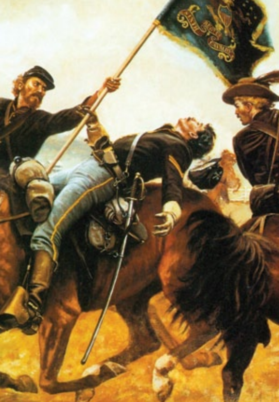
6th Cavalry regimental standard in the Battle of Gettysburg

battles and minor engagements and their dates. Evidently, the units never responded to the request, for no record has been found that any certificates were prepared. 26