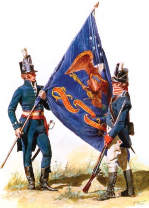
25th Infantry Regimental Standard, 1813–1814

With the new system to display battle honors, the Historical Section, Army War College, expanded the list of battles and campaigns in April 1921. There were now 94 campaigns: 13 for World War I, 10 for the Philippine Insurrection, three for the China Relief Expedition, three for the War with Spain, 13 for the Indian Wars, 25 for the Civil War, 10 for the Mexican War, six for the War of 1812 and 11 for the Revolutionary War. The inscriptions for the Indian Wars consisted of the names of the tribes involved but without the dates. Six months later two additional campaigns, one for the Indian Wars and one for the Philippine Insurrection, appeared on the list. At last the War Department had a comprehensive list of the Army's campaigns, a list that remained unchanged until World War II. 32