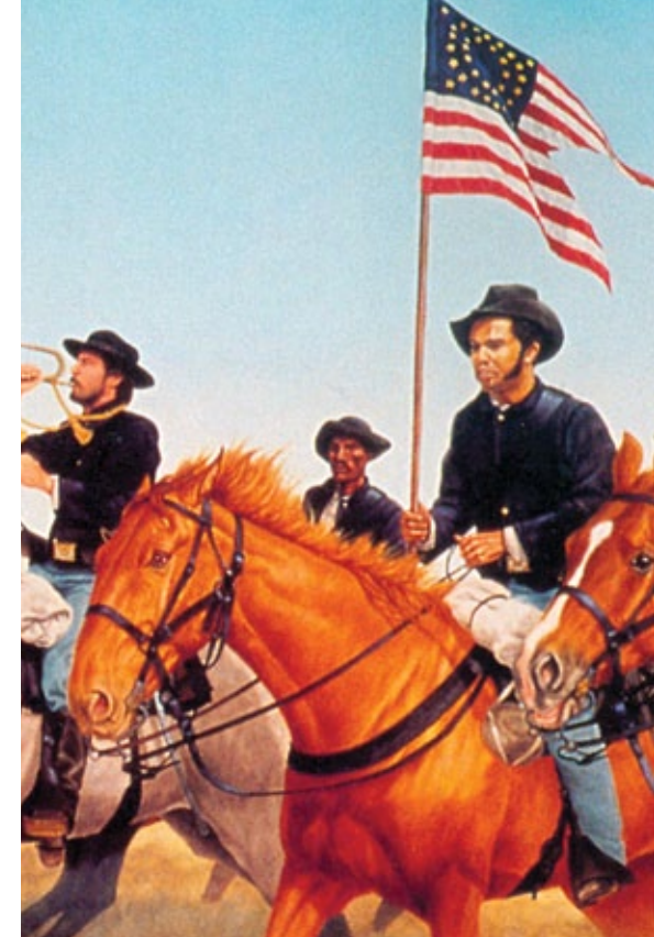
10th U.S. Cavalry Regiment flag in 1867

The new plan for displaying campaign credits cluttered the regimental flags, so in June 1920 the War Department changed the regulations again. This time the department directed each regimental color to bear streamers in the colors of the campaign medal ribbon for each war in which the regiment had fought. (Since no campaign medals existed for the Revolutionary War, the War of 1812 and the Mexican War, the Secretary of War was to prescribe the colors of the streamers.) The names of the campaigns were to be embroidered on streamers. If a unit participated in more than one campaign during a war, each streamer was to be inscribed with as many campaigns as possible. Under the revised regulations, a regiment displayed an honor if at least one regimental battalion earned it, and a separate battalion displayed an honor if two or more companies took part in the campaign. A company was not to receive credit unless at least one-half of its actual strength was engaged in the fighting. Once again, the names of battles and engagements embroidered on streamers were to be recorded in the Army Register above the list of officers of the organization. 31