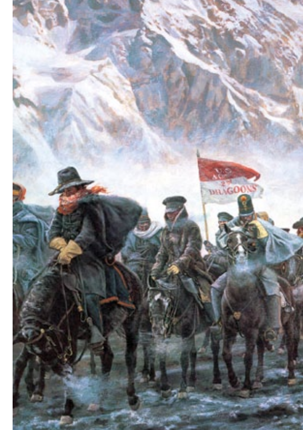
Dragonon guidon, 1857