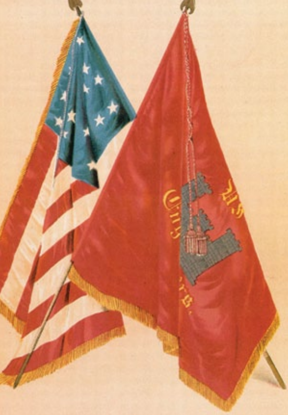
National and Battalion Colors of the Battalion of Engineers

The board also explored the question of how detached artillery batteries should display their battles. It determined that artillery batteries (as well as cavalry) were entitled to bear on their guidons the names of battles in which they served independently. Furthermore, The Adjutant General was to place the names of those battles in the Army Register next to the letter of the battery. Battery honors were not to include those to which its parent artillery regiment was entitled, but only the battles in which the battery had served independently on detached service. Since all artillery batteries were entitled to carry guidons, the board thought it was appropriate to determine whether detached batteries having served as infantry should inscribe the names of their battles on the guidon. Although such a determination seemed fitting, the board side-stepped the issue. 15