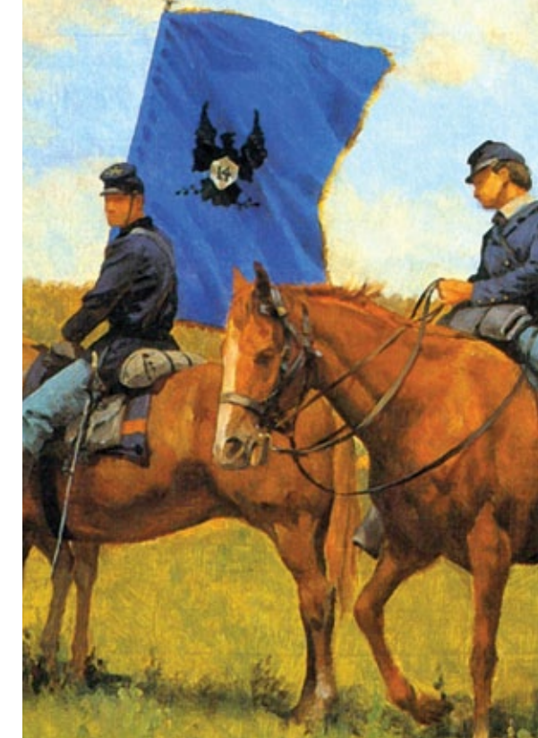
The flag of XIV Corps at the Battle of Chickamauga, 1863

It was determined that two or more companies of a regiment had to be engaged to have the name of a battle inscribed on the national color. The board based that number on tactics and regulations, which entitled a regimental battalion to carry the regiment’s colors. (In 1878 a regimental battalion had no set structure.) As for regiments formed through consolidation as in 1815 and 1869, the board declared that the new unit inherited the honors of all previous organizations that now comprised it. 14