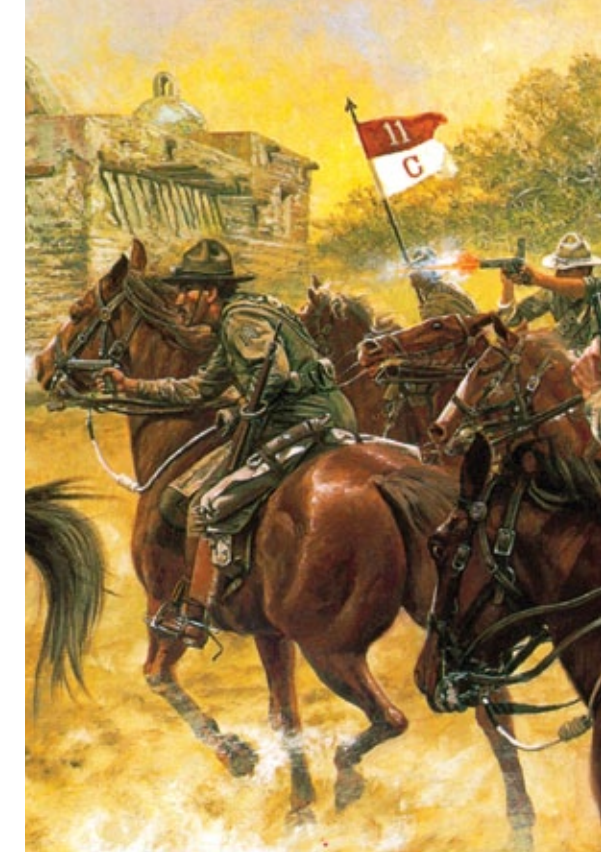
11th U.S. Cavalry guidon

Although the requisitioning of silver bands was held in abeyance, in 1915 Army Regulations authorized the Office of The Adjutant General to furnish each company, troop and battery with a suitably embossed certificate with the names and dates of all battles in which the unit had participated. The certificate was also to include the names of the enemy units engaged. A similar certificate was to be prepared for minor "affairs" of each company, troop and battery. When Troop K, 3d Cavalry and the 38th Company, Coast Artillery Corps requested the certificates, the Office of The Adjutant General returned the applications to the units and requested information about the