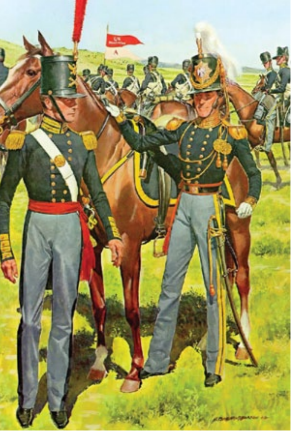
Dragoon Regimental flag, 1836

The orders for inscribing the names of battles on flags pertained to the national color, the Stars and Stripes, not to the regimental color. Infantry and artillery regiments carried both the national color and their organizational color. The national color had the name of the regiment embroidered on the center stripe, and the stars were gold although the regulations prescribed them to be white. Each artillery regiment carried a yellow color with two crossed cannons in the center, the letters "U.S." above the cannon, and the designation of the regiment on a scroll below. Each infantry regiment flew a blue standard with the Seal of the United States (sometimes embroidered but more often painted) in the center; under the eagle, on a scroll, was the designation of the regiment. 6