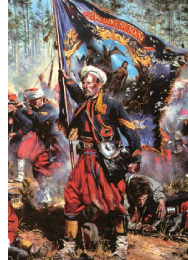
5th New York Volunteer Infantry Regiment during the Civil War

With Taylor's endorsement, Secretary of the Army Wilber M. Brucker approved the proposal on 3 April 1956. His sole caveat was that only