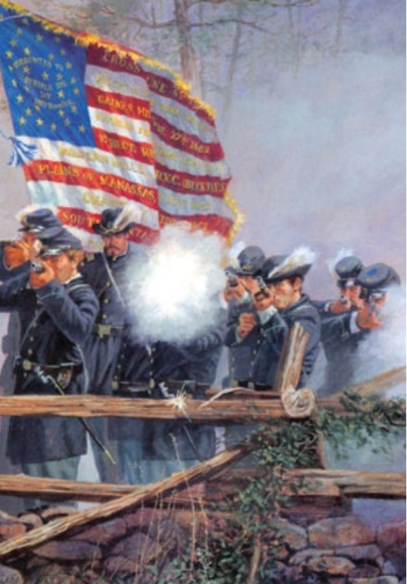
13th Pennsylvania Reserves flag with battle credits during the Civil War

of battles had not been completed; the following year the Office of The Adjutant General informed the 25th Infantry that the list had not been compiled and it was impracticable to make such a compilation at that time. In 1903 Francis B. Heitman, a former employee in the War Department, published the Historical Register and Dictionary of the United States Army. This unofficial work devoted more than 80 pages to listing the battles of the Army from 1775 to 1902. 20