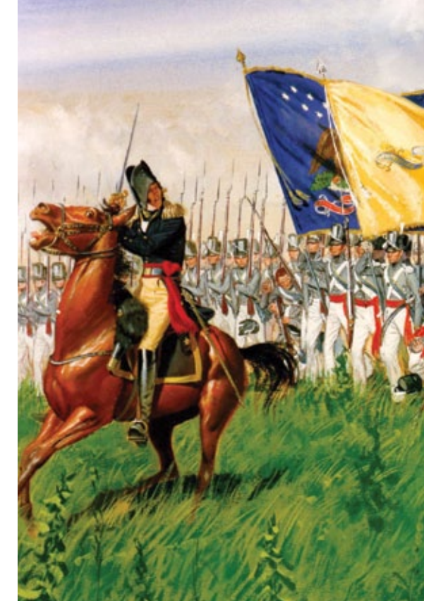
The Battle of Chippewa, 1814